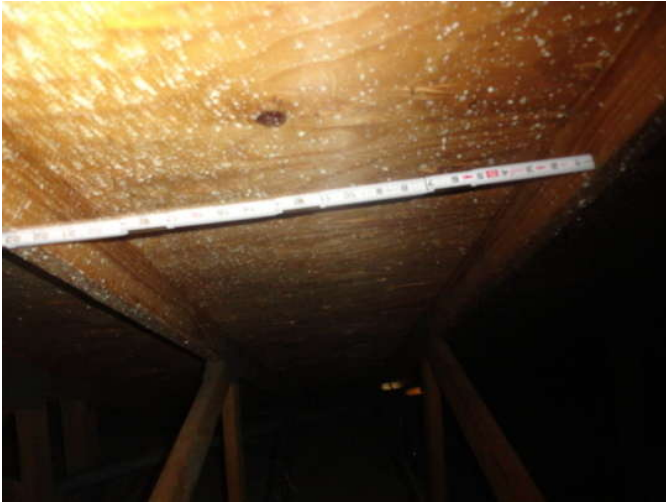
Roof Deck Attachment; Roof trusses are 24" O.C.