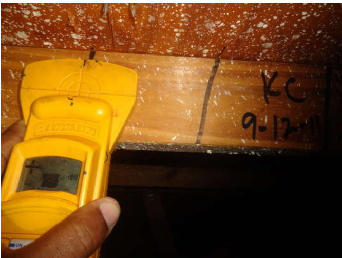
Roof Deck Attachment; 8d Nail.