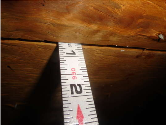
Roof Deck Attachment; 5/8" Plywood Deck