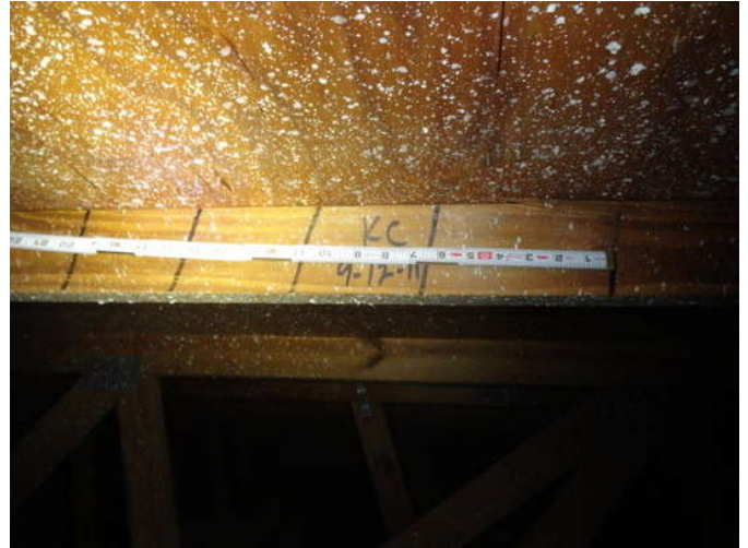
Roof Deck Attachment; 8d Nails with 6x6 Spacing