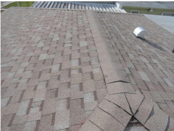
Roof covering; Shingle, Roof application date 4/28/2007