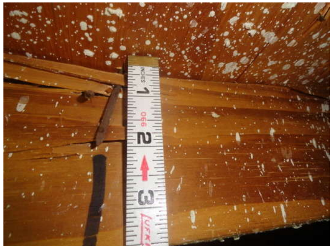
Roof Deck Attachment; 8d Nail.