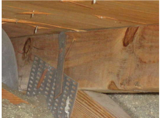
Roof to Wall Attachment; Single wraps with 2 nails on one side, and one on the other